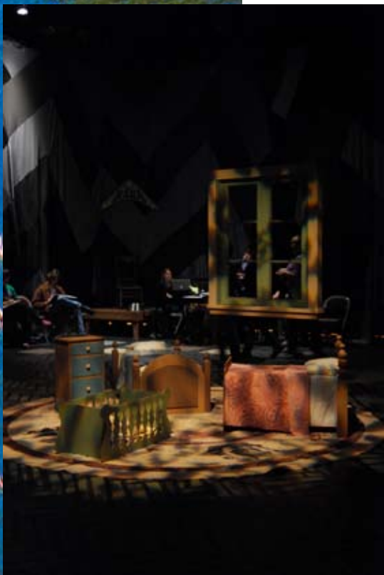
Stage setting for "Book of Tink."

"Our program has a stellar reputation and ranks among the top 10 in the country," said Hill. "Our alums have been very successful because their training here not only deals with the job skills required, but also how to do self marketing, job interview techniques and how to land the job." All valuable skills indeed.