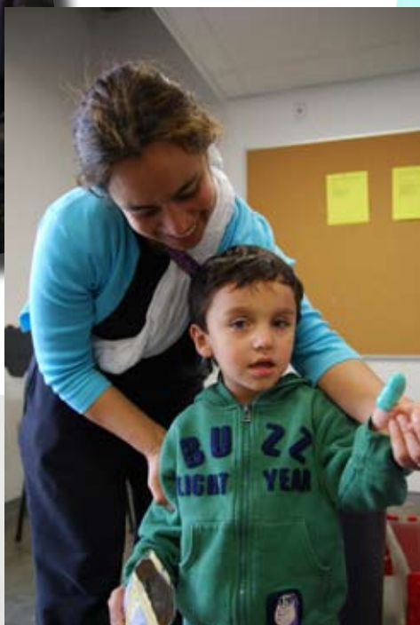
Parents have as much fun as the kids at the Beall Center's Family Days.