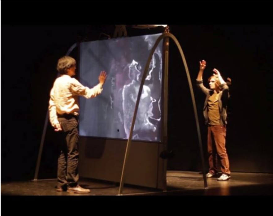
*image is a sample image of previous installation; image of new work will be available after 10/01/16

Three projectors, three cameras, three computers, custom software / Dimensions and duration variable